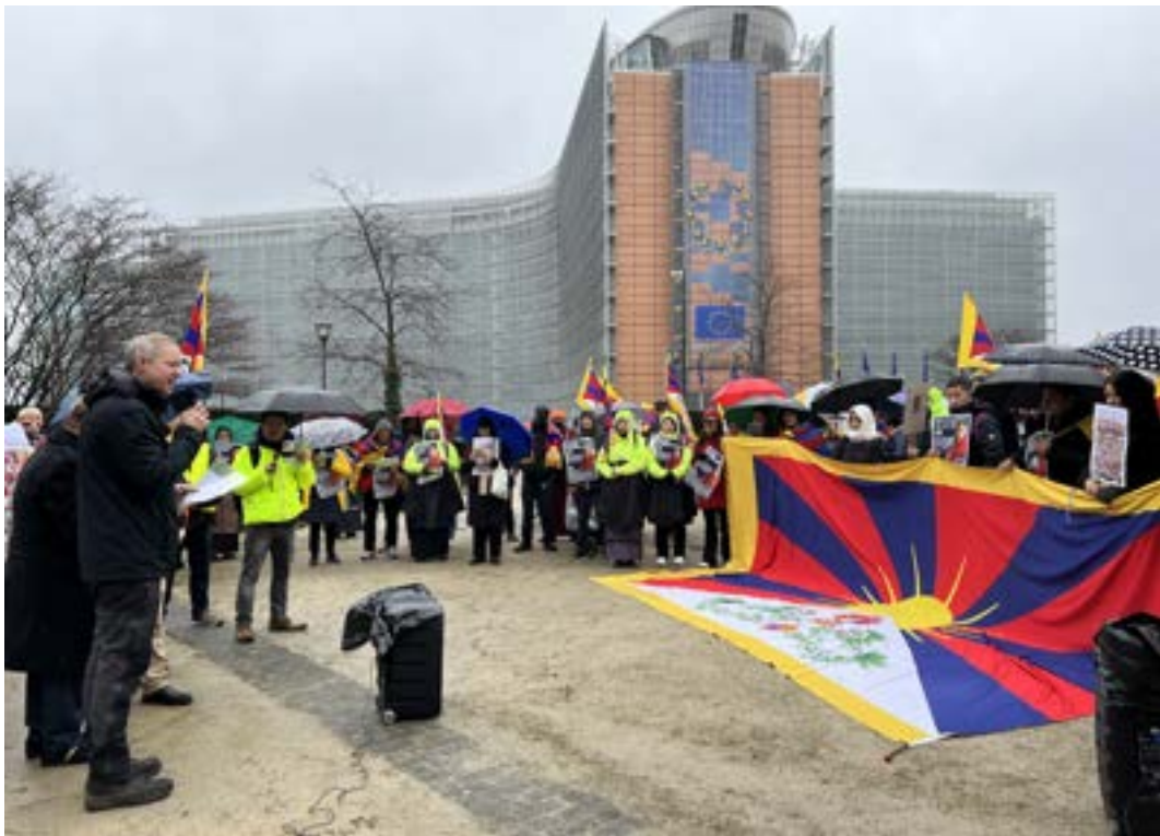
Uprising Day 2023 in Brussels

ICT took part to an NGO briefing with Jan Hoogmartens, Head of Cabinet of the Minister of Foreign Affairs and Delphine Delieux and Amélie Derbaudrenghien, also from the Cabinet. The meeting aimed at providing an up-to-date insight in the current human rights situation in the country, ahead of the visit of Belgian Prime Minister and Minister of Foreign Affairs to China.