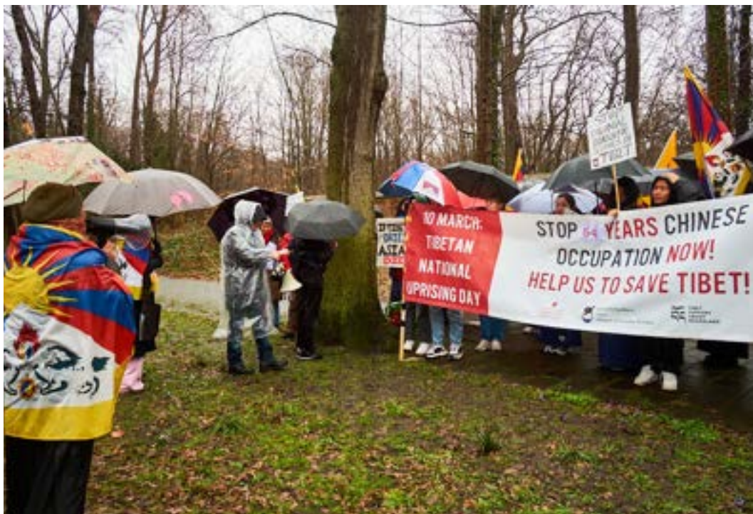
Uprising Day 2023 in The Hague

Moreover, on 10 July in The Hague, Tibetans, ICT Europe and the Tibet Support Group Netherlands expressed their concerns regarding the human rights situation in Tibet during a debate on China in the Dutch Parliament. They called for increased engagement from the Netherlands and the EU in the region. The debate revealed the significant economic dependence of the Netherlands and Europe on China, prompting calls to reduce this dependency and gain more autonomy.