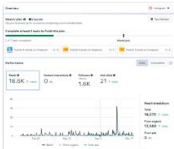
Statistics Instagram 2023