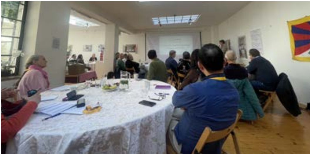
A workshop during the Europe Regional Meeting of Tibet Support Groups in Prague in April