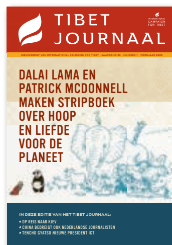
Example Newsletter 2023

NSICT's newsletter, Tibet Journal, is one of the primary communication tools to keep donors informed about the human rights situation in Tibet and NSICT's activities in the Netherlands and globally. We also introduce new fundraising programs such as the webshop, periodic donations, and bequests. In 2023, two newsletters were sent to all NSICT donors and supporters who wish to receive the newsletter.