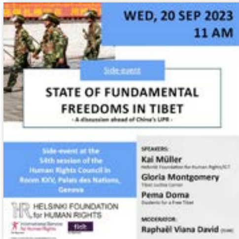
The poster of the side-event to the 54th Session of the UN Human Rights Council on the situation in Tibet organised by ICT on behalf of the Helsinki Foundation for Human Rights

We also supported the UN Team's work ahead of China's review by the UN Committee on Economic, Social and Cultural rights, as well as its 4th Universal Periodic Review (that took place at the beginning of 2024), including the production of a joint submission with FIDH on the situation in Tibet since the last review and the organization of a side-event on "The state of fundamental freedoms in Tibet" during the 54th session of the Council in September. Closer to the review, we also sent out advocacy letters and had meetings with EU diplomats to urge their countries to make strong recommendations on Tibet during the review.