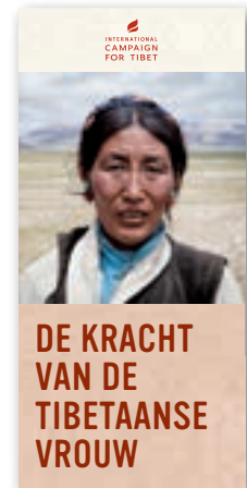
Example Special appeal 2023

In April, the Special Appeal with the theme 'Culture' was sent to a specific segment of the donor database. The second Special Appeal in August had the theme 'Women of Tibet'. The last Special Appeal of 2023 in late November had the theme 'Peace'.