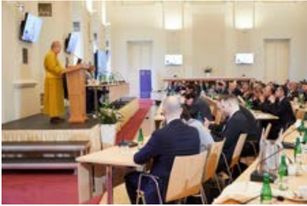
Telo Tulku Rinpoche speaking at the Ministerial on 28 November