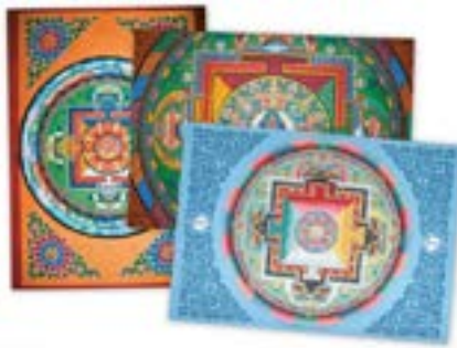
Examples of 3 webshop products