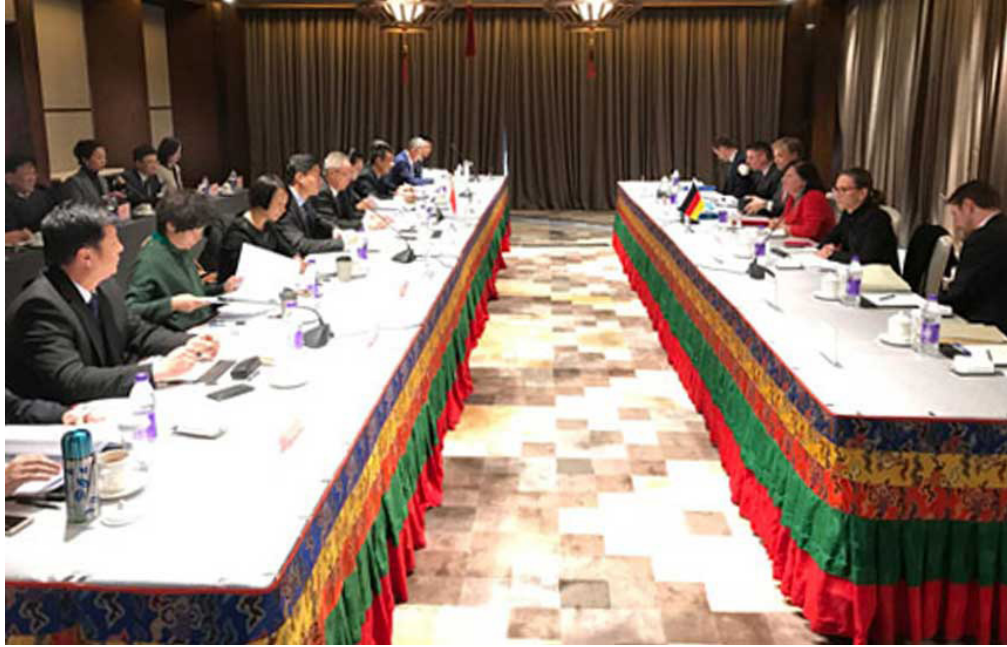
Germany's Commissioner for Human Rights Policy and Humanitarian Aid Bärbel Kofler in Lhasa for the 15th China-Germany Human Rights Dialogue held from December 6 to 8, 2018. It was participated by officials of the Supreme People's Court of China, the United Front Work Department of the Central Committee of the Communist Party of China, the Ministry of Public Security of China, the Ministry of Justice of China.

The coverage of the visit in the Chinese state media referred predictably to the “the outstanding achievements” of the Communist Party leadership under Xi Jinping in Tibet. [40] The German Human Rights Commissioner did not hold a press briefing in Beijing after the visit, as delegations to Tibet once used to do, reflecting the high levels of control by the Chinese authorities over messaging by foreign delegations.