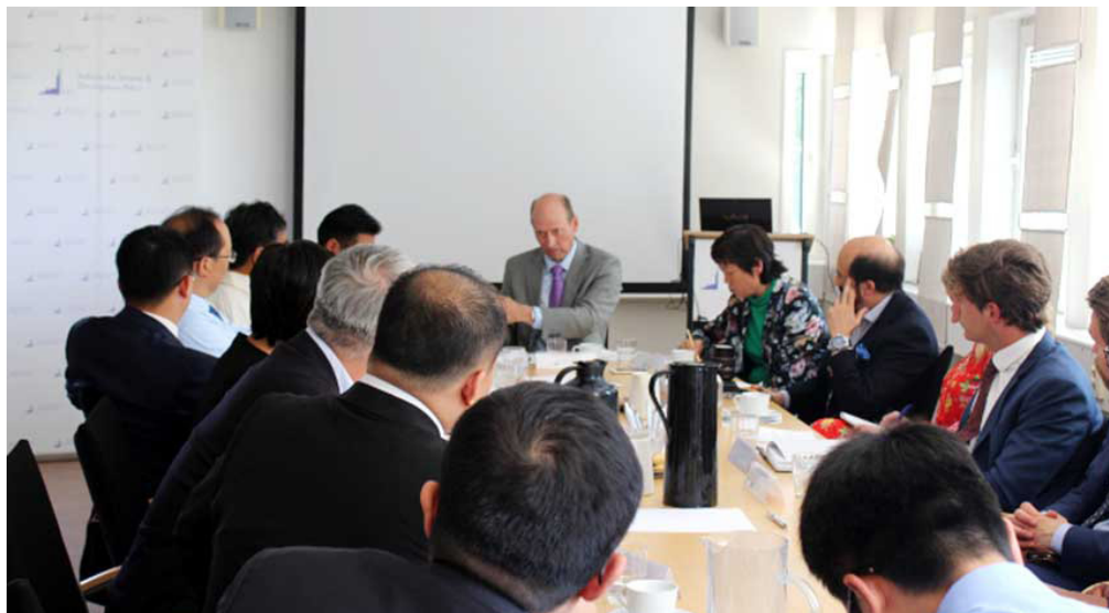
The Institute for Security and Development Policy in Stockholm organized a roundtable with a delegation from the Tibetan Academy of Social Sciences, the Chinese Academy of Social Sciences and the China Tibetology Research Center on June 25, 2018.

The hosts in the West of these delegations, including respected scholarly institutions, think-tanks, and governments, may not always be aware that while their purpose is presented as engaging in dialogue (and while sometimes a level of engagement may indeed be possible), ultimately these delegations are part of China's strategic information operations, reflecting the vigorous propaganda efforts of the United Front Work Department. Official Chinese delegations to the West are tightly controlled, and every intention is made to ensure they have the opportunity to issue boilerplate statements without challenge at non-public events. Meetings with ordinary Tibetans in the diaspora who might raise sensitive questions are avoided, and mostly governments and even civil society and academic hosts concede to their specifications.