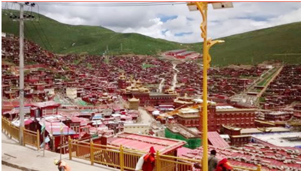
Larung Gar Tibetan Buddhist Academy, summer, 2018.

While tourists may see for themselves that the devotional element of Tibetan Buddhist religion is still thriving in Tibet, they may fail to grasp that the survival of the Buddhist culture, so critical to Tibetan identity, is facing its most severe crisis as the Chinese leadership implements an oppressive plan to “Sinicize” religion in Tibet and across the PRC. It may also not be apparent that behind the modern urban façade, a growing underclass of Tibetans are increasingly marginalized and impoverished, without access to even basic healthcare and education. China’s economic policies, imposed from the top-down, are resulting in a dramatic and irreversible change to Tibetan people’s lives with little or no consideration for the differences between Tibetan and Chinese culture and traditions.