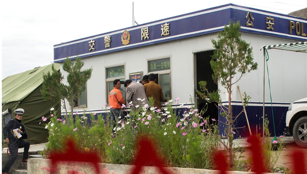
Security checkpoint in the Tibetan Autonomous Region, 2017.

there was a steady outflow of 2500-3500 per year. In 2019, the figure dropped to a staggering low of 18 Tibetans who escaped into exile and were received at the reception center in Dharamsala, India. [65]