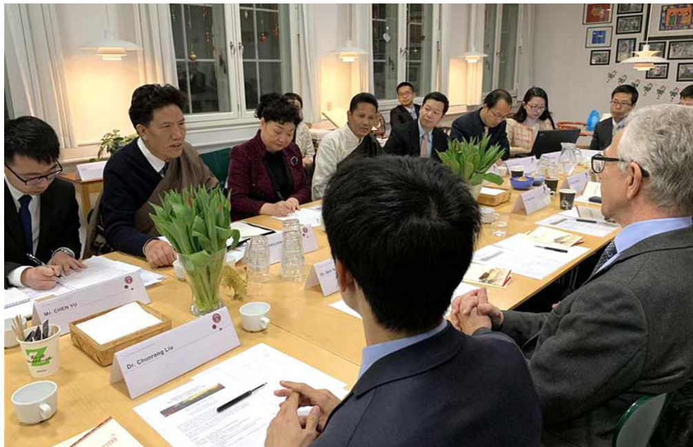
Lobsang Gyaltzen (2nd L), chairman of the Standing Committee of the Tibet Autonomous Regional People’s Congress, meeting scholars from Nordic Institute of Asian Studies at Copenhagen University in Copenhagen, Denmark, on Dec. 14, 2018.

Various Chinese officials have been prominent in overseas propaganda visits to the U.S. and other countries in the last few years; one of them is Lobsang Gyaltzen (rendered in different ways in Chinese media including ‘Losang Jamcan’) head of the Standing Committee of the Tibet Autonomous Region People’s Congress. Lobsang Gyaltzen has led delegations to the U.S. and in 2018 travelled to Belgium, Denmark and the Netherlands, where he made particularly strident criticisms of the Dalai Lama. In a visit to Europe made in the same month as the passing of RATA into law in December 2018, Lobsang Gyaltzen told Danish Parliamentarians that he hoped they would “recognize the Dalai Lama’s anti-China separatist nature,” taking the hardline approach of stating that: “The contradiction between us and Dalai group is neither a national or religious issue, nor a human rights issue, but a major issue of principle concerning national sovereignty and territorial integrity.” [28]