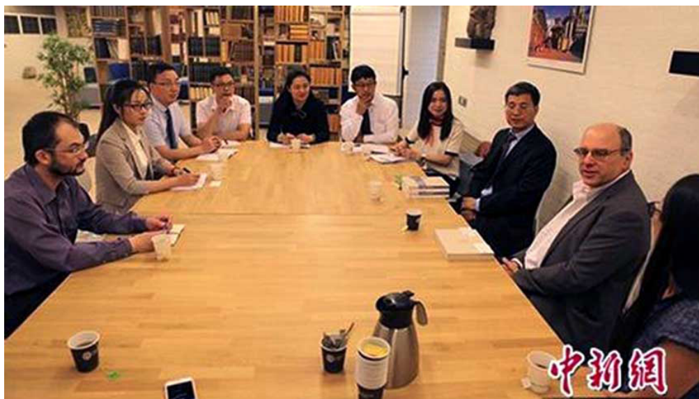
A Chinese delegation on Tibetan studies meeting scholars from Leiden University in the Hague, the Netherlands, on May 25, 2018.

Analysis of the Tibet-related Chinese delegations to the West reveals a political agenda often based on Tibet visits or criticism of China’s policies by host governments, and also connected to visits by Tibetan Parliamentarians in exile and the Sikyong (President of the Central Tibetan Administration) Lobsang Sangay – for instance linked to the latter’s visits to the Belgian Parliament, the French Senate, and Lithuania. Previously, official Chinese delegations have coincided with the Dalai Lama’s overseas trips to these countries, in largely unsuccessful attempts to undermine and undercut his message, but this has been less visible in 2019, as the Dalai Lama did not make foreign trips.