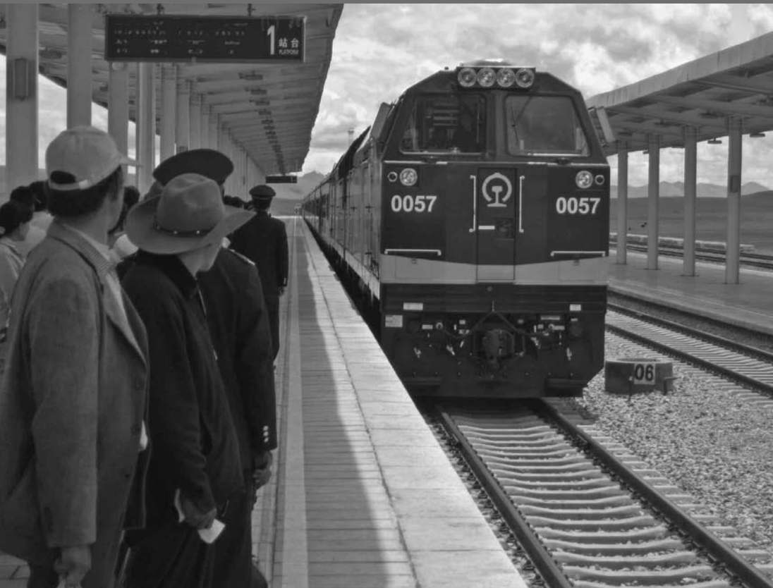
Most passengers on the railroad from Golmud and beyond traveling to Lhasa are Chinese migrants, settlers and tourists. This image depicts a group of passengers getting ready to board the train at the Nagchu (Chinese: Naqu) station on their way to Xining. (July 2007.)