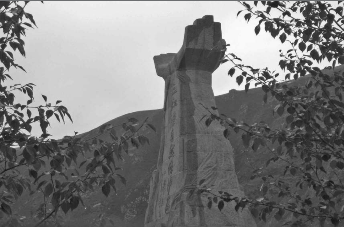
This new statue, entitled 'Homage to Jiang Zemin', was built near Jyekundo (Chinese: Yushu) in Qinghai Province, eastern Tibet, to mark a visit there by the then President and Party Secretary Jiang Zemin. According to the visitor who provided this image to ICT, the open hands are intended to symbolize respect for the environment, although the statue stands next to the only major road-bridge, advertising billboard and building development in the area.