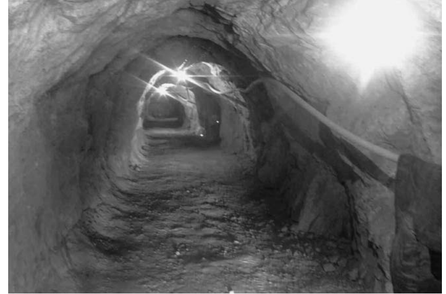
An image provided from inside the Shethongmon (Chinese: Xietongmen) copper mining project near Shigatse (Chinese: Xigaze) in the TAR, run by Canada's Hunter Dickinson Inc. through its subsidiaries of Continental Minerals and Tibet Tianyuan Minerals Exploration, Ltd. Once officially in operation, the mine is expected to have an annual production of 1.17 million ounces of silver, 116 million pounds of copper, and 190,000 ounces of gold.

Lama Mountain is a day-long walk from Tana township where Chinese miners have searched and we heard that Chinese miners have found oil there. The color of the mountain is red. Some people say that there is gold there. In 2004, our township leaders associated with the Chinese miners constructed roads and now we can reach the Lama Mountain in 3 hours by truck. The township leaders are of the view that this road will help the local nomadic Tibetan families and it was constructed for the convenience of nomadic people. However, it's for sure that it was constructed