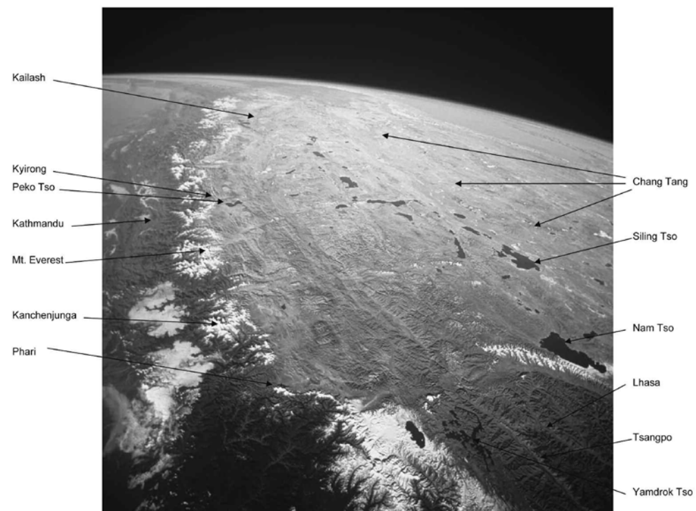
Tibet from space. The Himalayan Range looking from east to west with Tibet on the right. Nam Tso Lake is visible on the lower right of the image. taken on December 4, 1988. PHOTO ID NO. STS027-151-80.

By continuing to pursue a model of development that appears to increase rather than close the gap between urban and rural, rich and poor, Chinese and Tibetan, the Chinese state risks further marginalizing and alienating the Tibetan people, potentially undermining the political objectives of its current development: a stable Tibet within China.