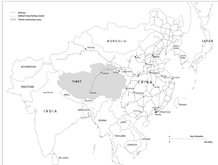
RAILWAY MAP OF CHINA &amp; TIBET

The opening of the Qinghai-Tibet rail lines marks Tibet's further integration into the Chinese transportation system. It is now possible to travel directly from Beijing to Tibet by rail. IMAGE TAKEN FROM THE ICT REPORT, 'CROSSING THE LINE' (2003).