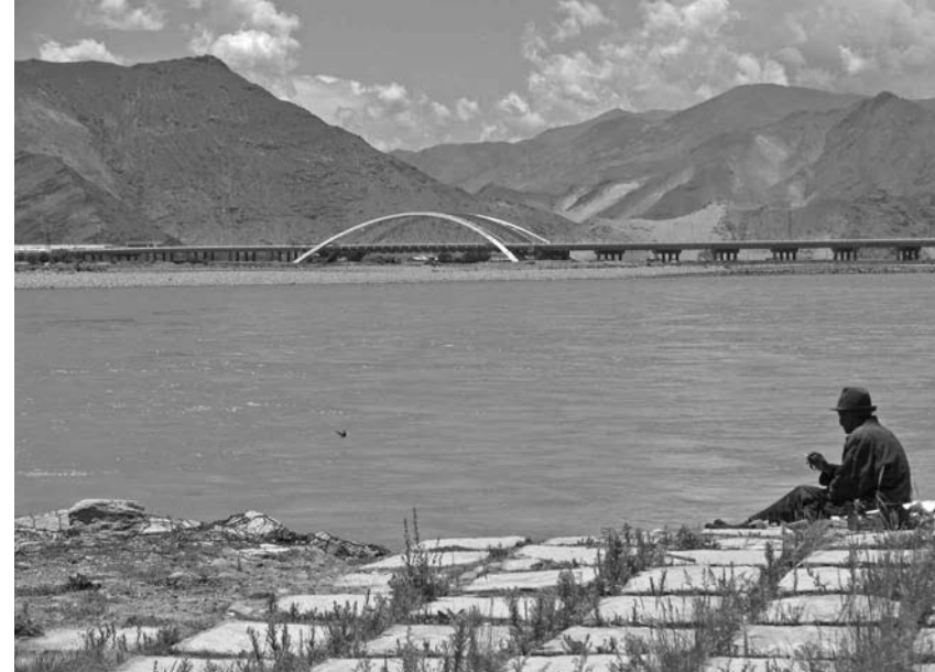
The design of the new Ne'u (Chinese: Liuwu) bridge over the sacred Kyichu River in Lhasa is intended to resemble Tibetan khatags (white offering scarves). (July 2007.)

It is only now with the coming of the railroad that industrialization is properly beginning, with the beginning of large-scale mining and the often controversial