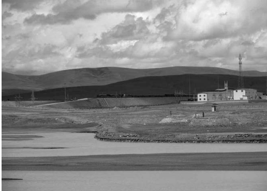
Of the 45 train stations between Golmud and Lhasa, 38 are un-staffed, and even fewer are open to passengers. Here, the train to Lhasa leaves the small station of Thogthon, 409 km south of Golmud. (July 2007.)

To an economist, a rise in mineral extraction, or a rise in the production of wool and dairy products would both count as economic growth, hence growth in per capita GDP. But in reality, mineral extraction undertaken by large corporations providing minimal local employment may add almost nothing to a local economy. Beijing's long-haul plans for mining Tibetan areas confers benefits elsewhere, while Tibet must cope with degradation of the environment, loss of amenities, resource depletion, and a surge of immigrants.