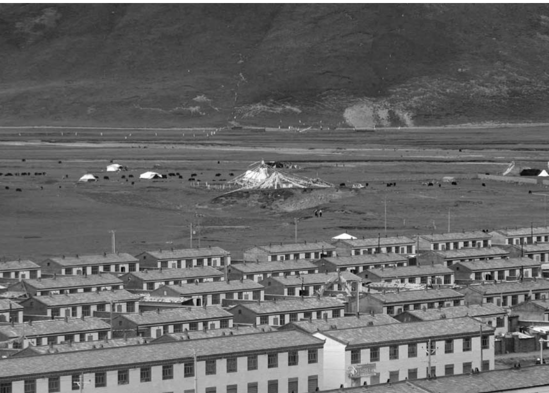
With more than a hundred buildings and more than 200 residences, the Darlag nomad settlement camp in Golok is one of the largest and most ambitious projects in Tibetan areas of the relocation of Tibetan herders. (August 2007.)

The number of Tibetans affected by forced settlement or resettlement in towns and cities is not known but so far it runs into the hundreds of thousands, according to data from official reports and other available material. The implementation of Chinese policies of dividing up land, fencing pastoral land and settling nomads is well advanced in many areas of eastern Tibet, including the northern areas of Qinghai such as Golok (Chinese: Guoluo) and Jyekundo Tibetan Autonomous Prefectures, as well as parts of Gansu, Sichuan, and Yunnan Provinces, and the TAR. Qinghai Province, including Golok, led the way in insisting on fencing and sedentarization. Official reports quoted earlier in this section make it clear that the TAR and other Tibetan areas are following