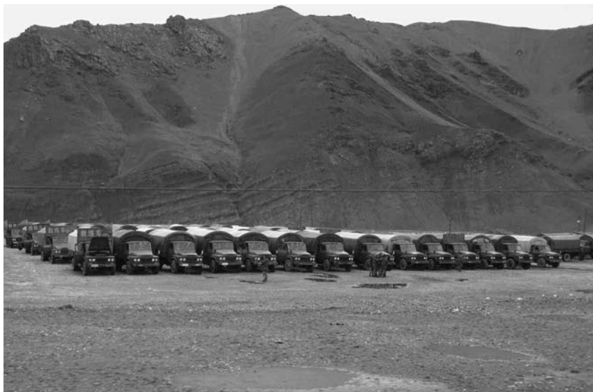
This image, provided by a visitor to Tibet, depicts a military training exercise in a remote rural area outside Lhasa. The banners mounted above the trucks on the left read "Military training convoy". There has been a stepping up of military readiness on the Tibetan plateau coinciding with the construction of the railroad.

which often exclusively employ non-Tibetan staff for ventures which are intended to benefit non-Tibetan interests.