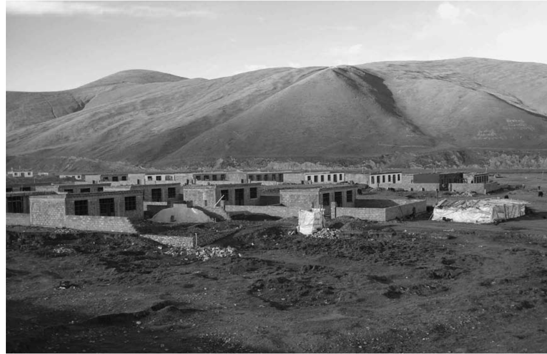
Nomad settlement camps are now under construction in many areas of eastern Tibet. This image shows a new settlement in the small town of Son mda’ (Chinese: Qingshuihe) in Kham (present-day Qinghai Province). (August 2007.)