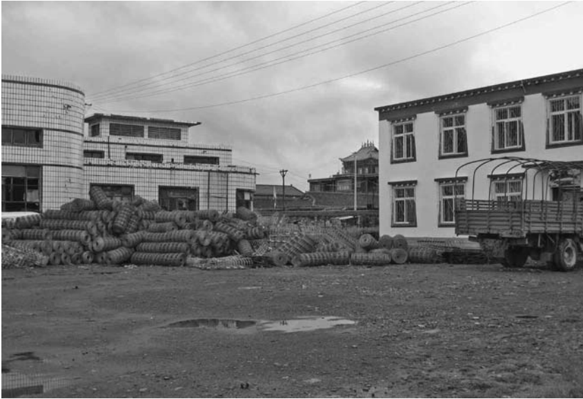
Bales of fencing wire to enclose sections of grassland at the Department of Forestry in Serthar County (Chinese: Seda) in Sichuan Province. (August 2007.)