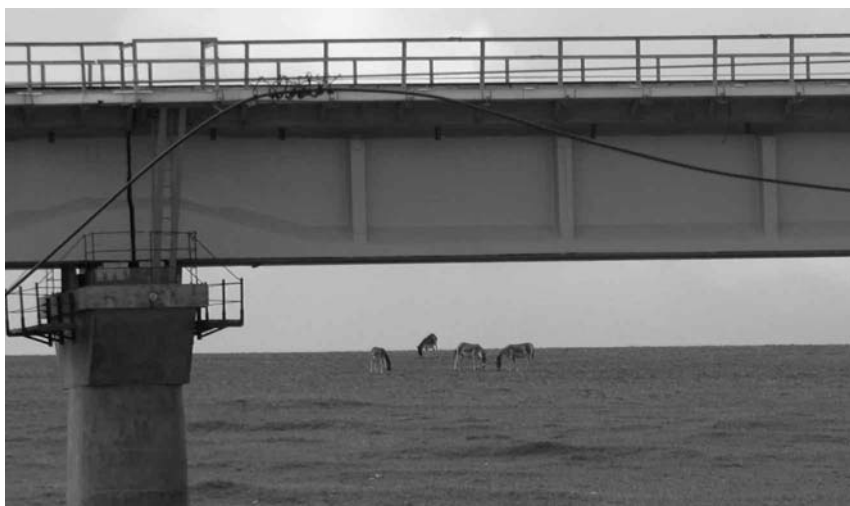
The 1142 km section of the railroad from Golmud to Lhasa traverses the vast high altitude plains mostly inhabited only by wild animals such as the Tibetan wild ass, or kiang, as shown in this image, and Tibetan antelope, or chiru. (July 2007.)

Our trip was more like an adventure tour. We had many destinations on the map but we didn't know much about the places. We didn't know which road to follow as there are many trails made by the nomads, miners, hunters and army. So we found our way by getting information from the nomadic families and using the GPS. Our goal was to explore the region.