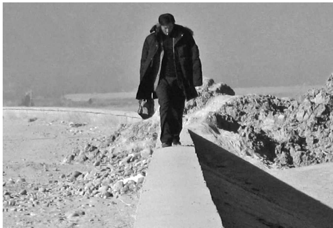
A Tibetan worker early on in the laying of tracks. Most workers on the railroad have been Chinese, with Tibetans doing largely unskilled manual labor.

The railroad's frailty had become apparent in the weeks following its opening. Chinese engineers, however ingenious, had not fully reckoned with global warming, which was raising temperatures faster than expected, and the foundations of the rail line had already begun sinking into the permafrost by the end of July [2006]. Thawing could cause tracks to bend and slump, and bridges to crack. In late August, a dining car derailed two hundred and fifty miles north of Lhasa, with no apparent effect on the train's oxygen-supply system. I tried not to think about the journey's likely perils as I drifted off to sleep for the second night on the train.