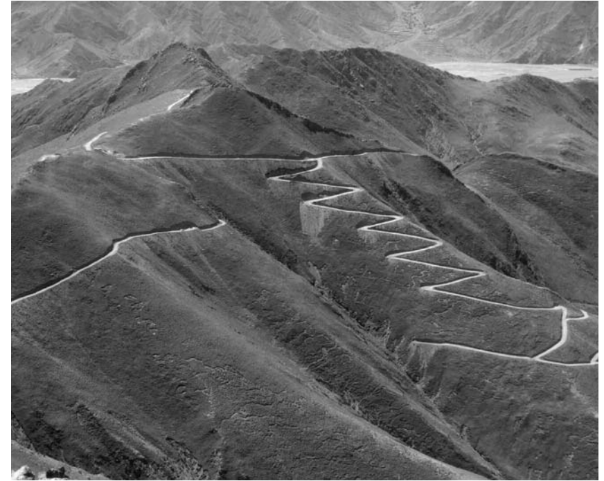
A road built for mining activities cuts across a hillside in Tibet. The damage caused to Tibet's fragile high plateau landscape by mining is a cause of concern both to Tibetans and increasingly, to many Chinese and Western scholars and policy-makers.

The report continues, "The GSM-R technology provided by Nortel for use on the [Gol-mud]-Lhasa railroad is part of China's surveillance architecture and thereby underpins the capacity of the state to monitor dissent and maintain political control in Tibet. Nortel cannot claim that it lacked prior knowledge of China's human rights record in Tibet because such information is widely available in Canada. In selling advanced communications technology to the state, the company failed to conduct adequate due diligence, even when shareholders requested that it do so. There is no observed effort on the part of Nortel to assess the potential impact of its investment on human rights." 20