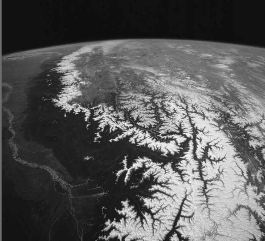
Tibet from space. Eastern Himalayan region, showing the Great Bend of the Brahmaputra River, where it makes a U-turn into India from its source in Tibet – where it is known as the Yarlung Zangbo. Because Tibet is the source of several of the world's largest rivers flowing into Asia, and plays a prominent role in the Asian monsoon system, the consequences of climate change on the plateau and China's policies of land use will affect the lives of millions of people downstream. PHOTO ID NUMBER: STS075-721-13.