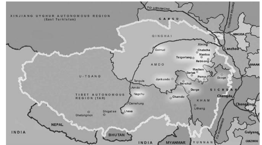
Towns and areas in Tibet where nomadic families are known by ICT to be subject to settlement policies. This is not a comprehensive overview of nomad settlement in the area; several of the main areas are singled out for this map. WITH THANKS TO HUMAN RIGHTS WATCH.

Professors Zhao Haoxin and Chen Yuxiang, contributors to a 2004 conference in Lhasa on sustainable development in mountainous areas, summarize the new policies of ‘modernization’ as follows: “Transform grassland agriculture. Pen-feeding or semi-pen-feeding with concentrated feed as supplementary feeding, wherever possible, is to be encouraged. The animal husbandry sector will be reformed and optimized. The goal is to form a pattern of breeding on pasturelands and fattening in farming and semi-farming areas. In order to protect pastures, the amount of livestock on hand will be scientifically regulated. In recent years, in order to improve the productivity and living conditions of farmers and herdsmen, the government has supported projects of ecological migration, herdsmen’s settlement, and drinking water supplies. To be out of the plight of poverty and be affluent is the dream of human beings.” 30