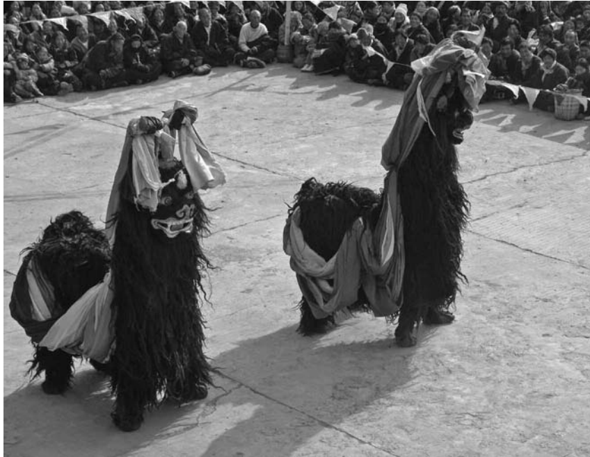
Despite China's repressive presence and control, religious celebrations and folklore festivals are still held in many areas of eastern Tibet. These two images show a state-sanctioned inauguration of the opening of a new 'Lineage Tree Hall' at the Kardze Monastery in Kardze Prefecture (Chinese: Ganzi), Sichuan. (November 2005.)

are answered in accordance with Chinese propaganda. The growing numbers of Chinese guides are displacing the Tibetan guides who can speak in depth — from personal experience — of Tibetan culture.” 55