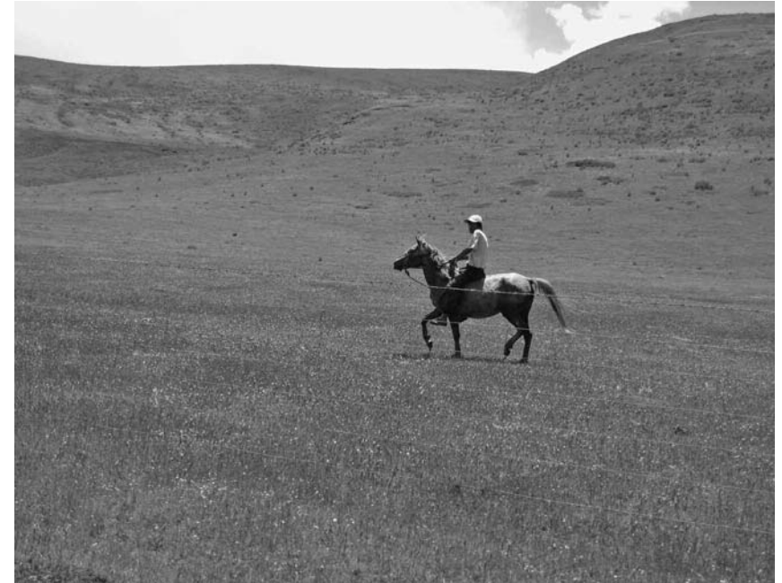
Hundreds of miles of pastures in Tibet are now fenced with barbed wire under the authorities’ plans to enclose the grasslands and settle nomadic herders, as seen here in Serthar County (Chinese: Seda) in Sichuan Province. (July 2007.)

A Western expert 44 told ICT: “In many areas, particularly in Kham, huge bales of fencing wire are dropped off in the middle of the grasslands by trucks. In many areas, the