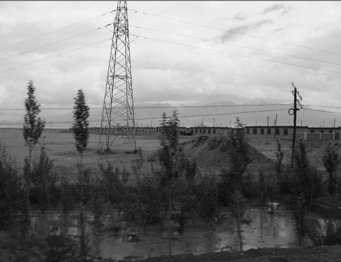
The Kunlun mountain range towers over the eastern section of the Golmud nomad settlement camp a few miles north of Nanshankou, the first station of the railroad to Lhasa.