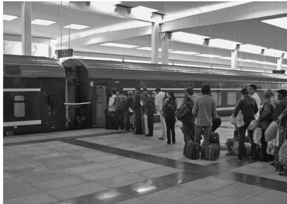
The Chinese government's dream of transforming the central Tibetan economy has just begun. Next to the transportation of industrial products the tourist industry is the greatest beneficiary of the railroad to Lhasa. Here, Chinese tourists and workers at Lhasa station board the morning train to Xining. (July 2007.)

“Equipped with comprehensive facilities, the train is safe and comfortable with staffs providing warm services. [...] The number of people getting access to such grand scenery increases considerably, while the plateau does not lose its real look thanks to the coordination of tourism development with environmental protection. The railway serves as a bridge between the plateau and the outside world and a link between mankind and nature.” 45