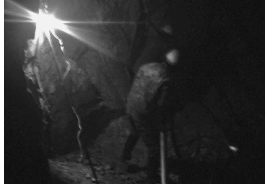
An image provided from inside the Shethongmon (Chinese: Xietongmen) copper mining project near Shigatse (Chinese: Xigaze) in the TAR, run by Canada's Hunter Dickinson Inc. through its subsidiaries of Continental Minerals and Tibet Tianyuan Minerals Exploration, Ltd. Once officially in operation, the mine is expected to have an annual production of 1.17 million ounces of silver, 116 million pounds of copper, and 190,000 ounces of gold.

Efforts to clamp down on mining and reassert control by the central authorities have gathered strength as officials have become more aware of the economic implications of increased access to resources since the opening of the railway. They seem particularly to have noted the illegal mining of state resources and the waste of irreplaceable