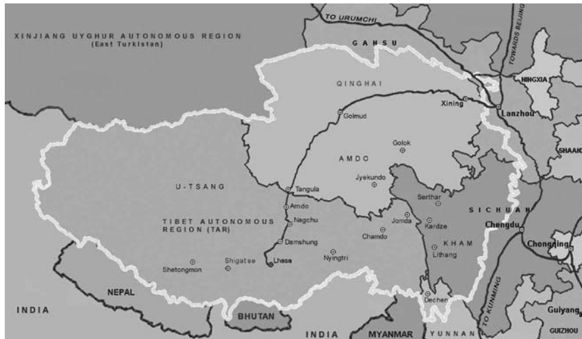
Existing main railroad lines, and towns and cities in Tibetan areas mentioned throughout this report.

intermediate stops at minor railroad stations within the TAR or Qinghai. This is left to other lines, such as the Lhasa-Xining line that in addition to major stations also stops at some minor ones, corresponding to the size and population of the villages and/or towns along the route. There are also ‘service stops’ apparently meant to load and unload goods, provide technical assistance if necessary, and deliver or pick up any sort of material. Tibetans living in the vicinity of these service stations cannot get off nor get on the train as there are only three stations offering passenger services between Lhasa and Golmud — Damshung [Chinese: Dangxiong], Nagchu, and Amdo [Chinese: Anduo]. It’s very difficult to get a seat or a sleeper for and from Lhasa. People often have to buy tickets weeks in advance, which makes trip-planning difficult for both Tibetans and Chinese. Together with the ticket all passengers receive a ‘health declaration form’ [Chinese: luke jiankang dengji ka ] to complete with all personal data including phone number and hand in to the station clerks before boarding. The passengers must declare they comply with the ‘regulations for traveling on the plateau’ [Chinese: gaoyuan luxing dishi ] and that their health status allows them to travel at more than 3000 meters above sea-level.”