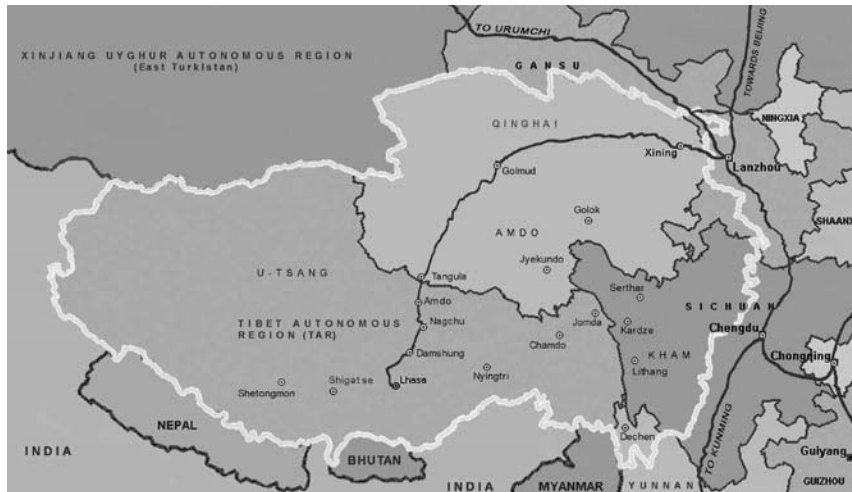
Existing main railroad lines, and towns and cities in Tibetan areas mentioned throughout this report.

Mozhu Gongka ], in Lhasa Municipality in the TAR alone, there are four mineral excavation sites. The biggest site is in Gyama and excavation at that site started in 1991. The main mineral is iron ore and according the Chinese statistics this mineral site would supply iron ore for 20 years. In one day, about 72 truck-loads are extracted and extraction would continue for nine months out of a year. The roads freeze in the winter, so work gets halted until the freeze thaws. People say the Chinese initially extracted a diamond the size of a cigarette carton and after that they started extracting iron ore.