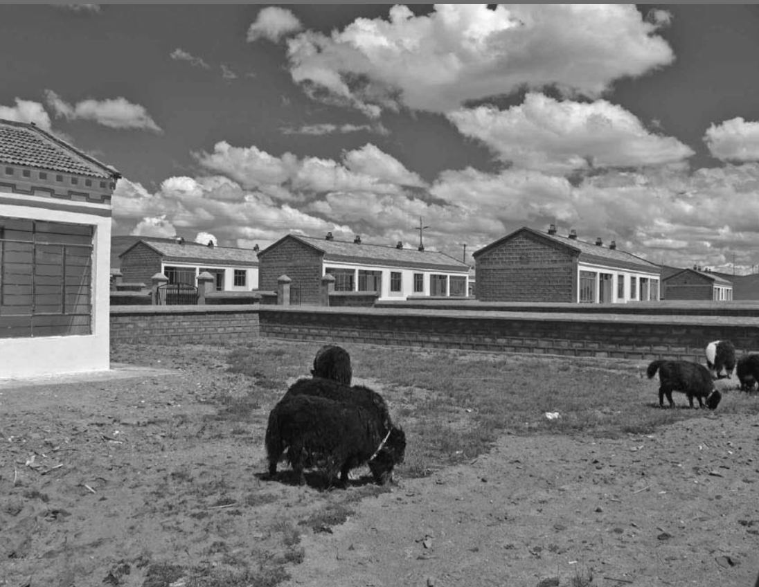
In stark contrast to grazing on the open rangelands, these goats make do with a patch of scrubby grass in a nomad settlement camp in eastern Tibet.