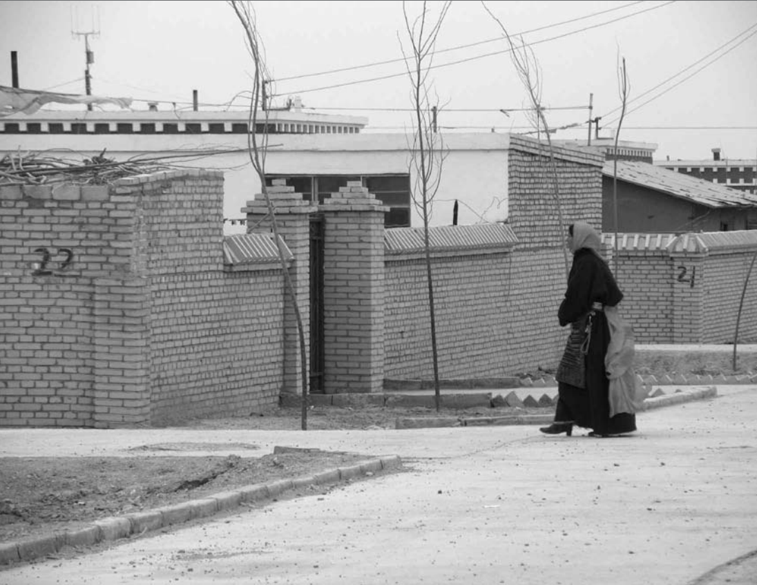
A building on the arid and sandy plains outside the southern areas of Golmud in Qinghai, at the beginning of the railway line to Lhasa. This Tibetan nomad settlement camp is one of the latest such projects completed in Tibetan areas.